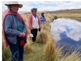
The Mountain Institute wins St Andrews Prize