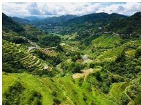
Food and tourism in the Philippine Cordillera