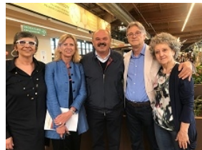
Discussing mountain products at FICO Eataly