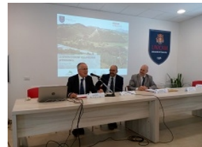
Green economies surge in the Apennines